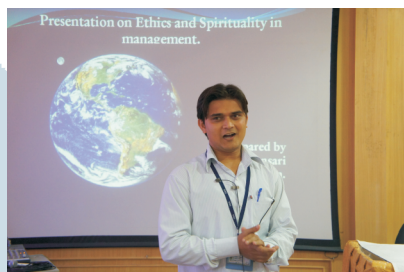
Students Seminar on Ethics and Spirituality, at SMS