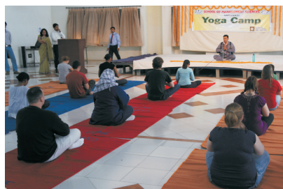
Yoga and Meditation Camp, at SMS